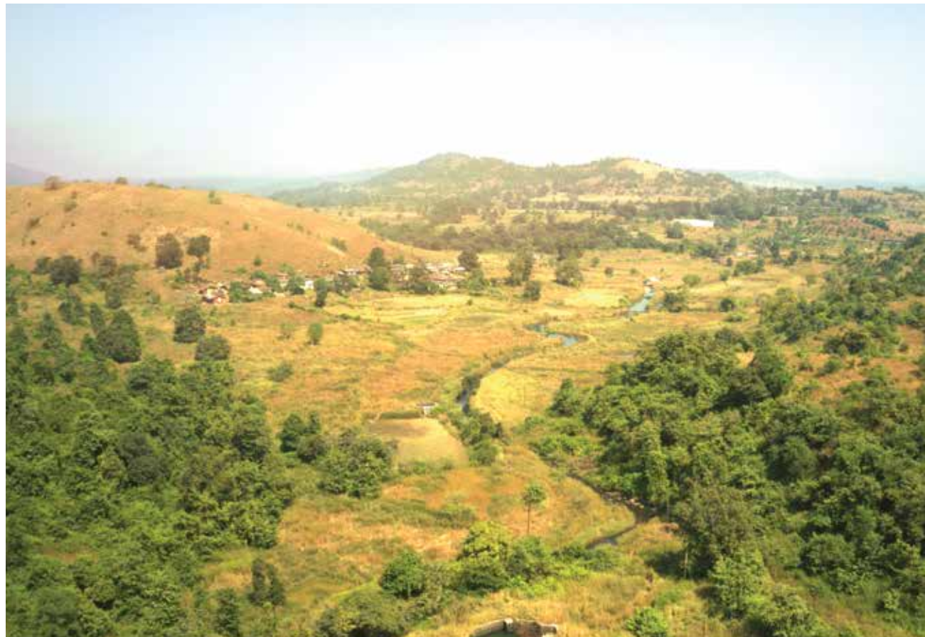
Actual Site Images